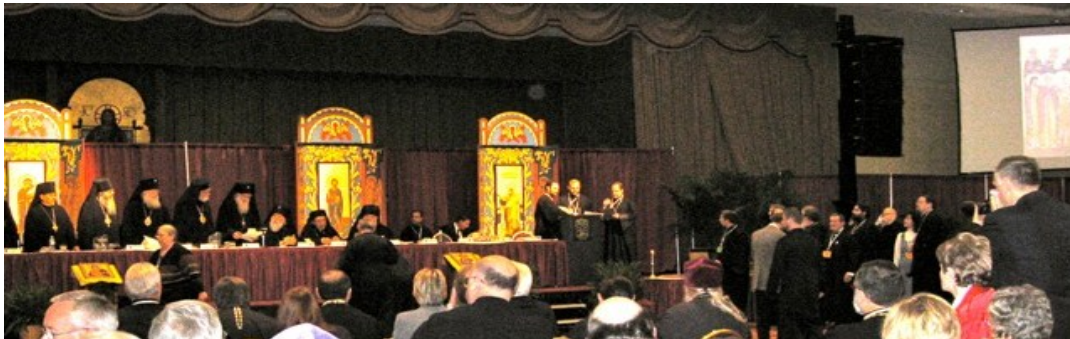
The 15th All-American Council in 2008

Please keep our delegates and our church in your prayers as the All-American Council approaches. May God bless you!