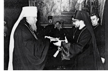
May 1970, On behalf of the Russian Orthodox Church, Metropolitan Pimen, presented the Tomos or decree of independent self-government to the head of the OCA delegation, Bishop Theodosius of Sitka, Alaska. He was subsequently elected Metropolitan, and in 1979 received New Skete into the Orthodox Church in America.

~Prayer in Preparation for the All-American Council